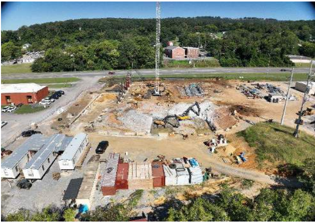
Aerial View from Southeast