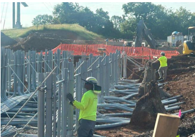
Electrical Conduit Installation