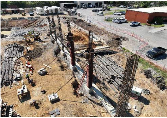
Bridge Crane Columns Installation