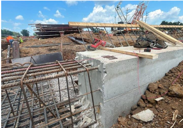
Grade Beam Form/Pour

In August 2025, grade beam forming, constructing, and pouring began. Underground piping installation continued, with the 24” RO waste piping and some PVC pressure piping being installed. A 12” ductile iron RO waste pipe had a preliminary hydrostatic test conducted, and passed. The electrical contractor continued to install various sized conduit throughout the project site. Vertical bridge crane columns are being formed in preparation for pouring. Excavation continued, including rock removal for the building foundation.