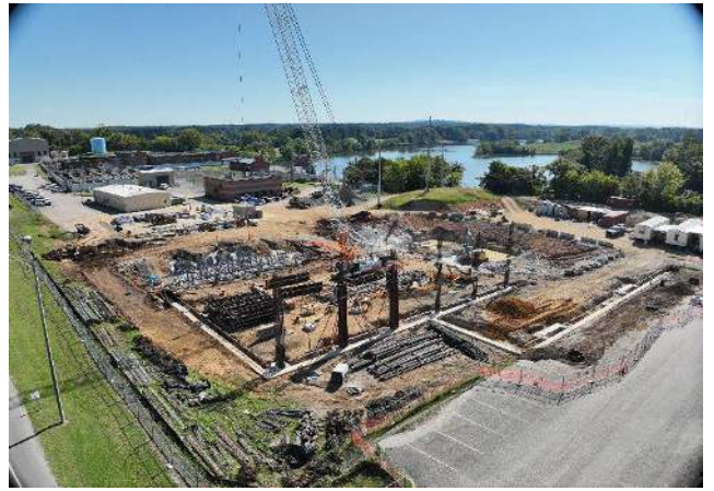
Aerial View from Northwest