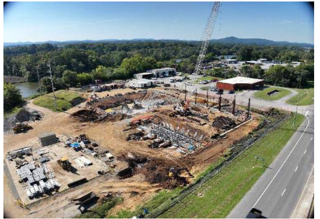
Aerial View from North