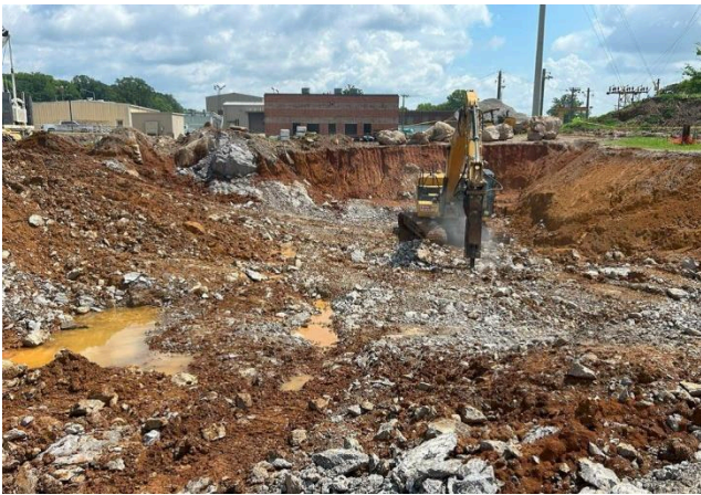
Ceramic Micro Filter (CMF) Area