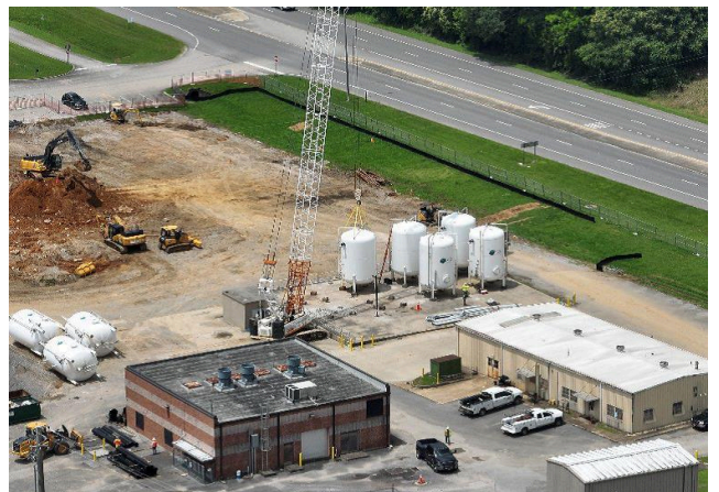
Intermediate GAC System Removal