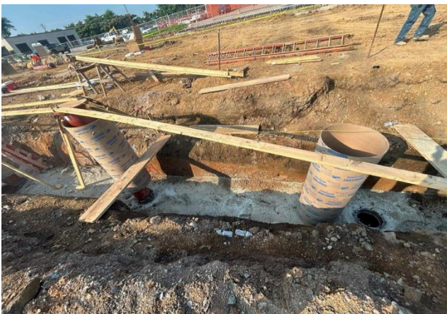
Piers Formed, awaiting Concrete