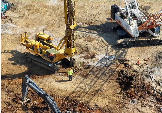
Drill Rig for Piers

In June 2025, construction materials and equipment continued arriving and being utilized on the construction site, which included the drill rig, additional excavators, a bulldozer, and cranes. Pier holes were drilled, forms were installed, and piers were set and poured. The intermediate granular activated carbon (GAC) system was disassembled and will be utilized in other treatment processes. Excavation for the process building continued.