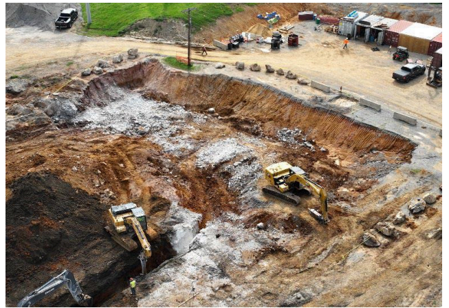
Process Building Excavation