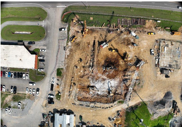
Aerial View from South