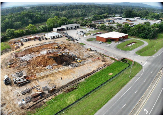
Aerial View from North