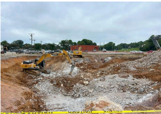
Process Building Excavation