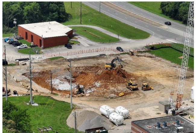
Aerial Process Building Excavation