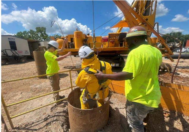
Pier Hole Inspection

In July 2025, additional construction materials continued arriving and being utilized on the construction site, which included the piping, electrical conduit, additional piers, and various connectors. Pier holes continued to be drilled, forms were installed, and piers were set and poured. Excavation continued, including rock removal for the building foundation.