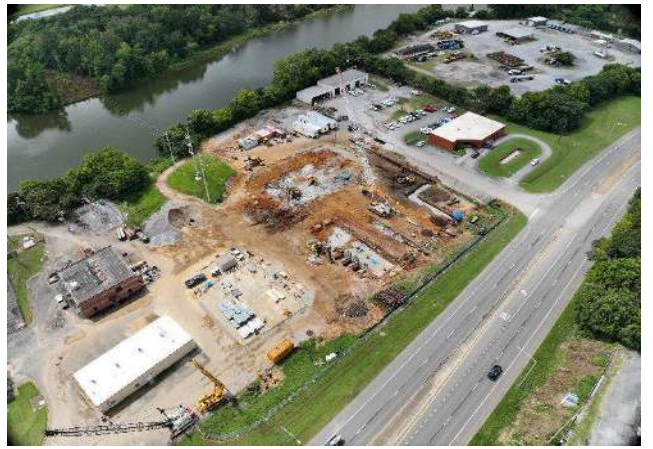
Aerial View from North