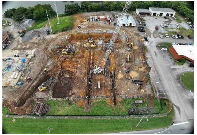
Aerial View from Northwest