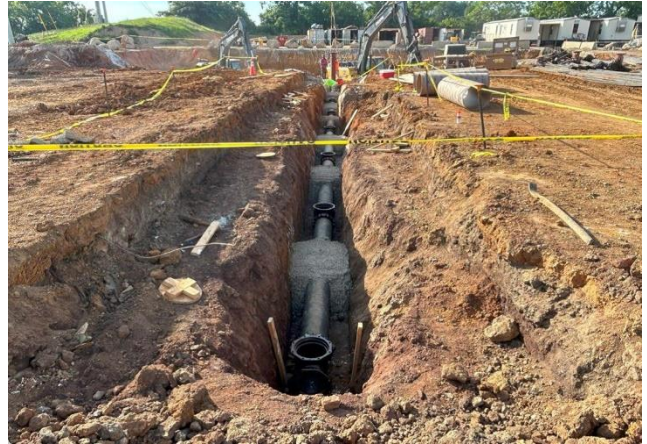
Process Building Underground Piping