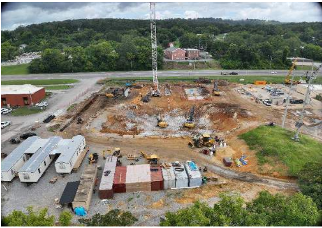
Aerial View from Southeast