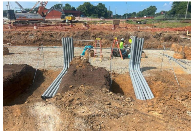
Electrical Conduit Installation